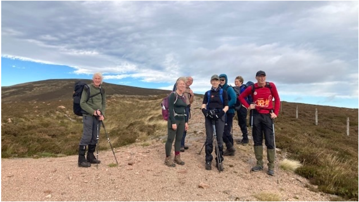
We leave the main track to continue towards Mt Battock