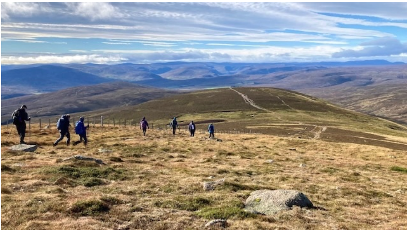
We start the descent