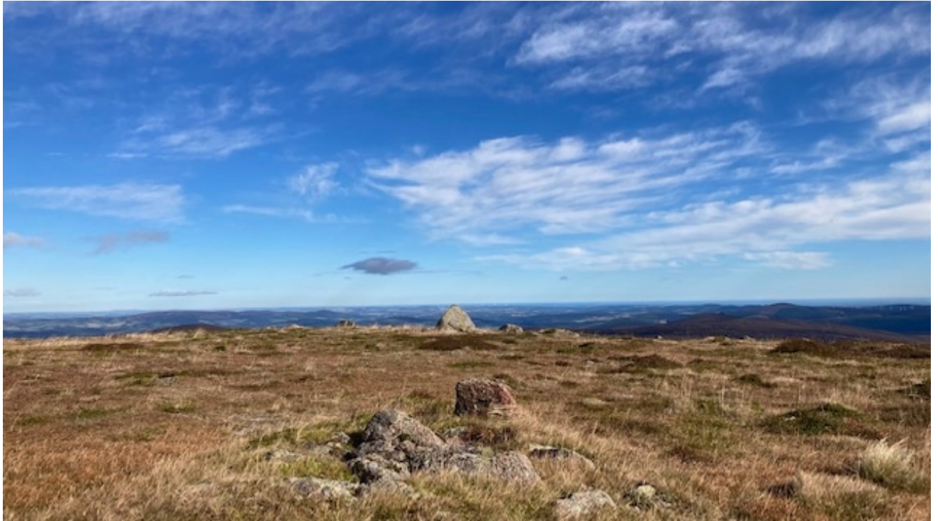
Another view from the summit