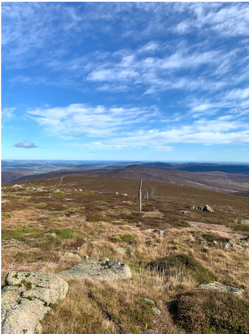
Looking North-east from the summit