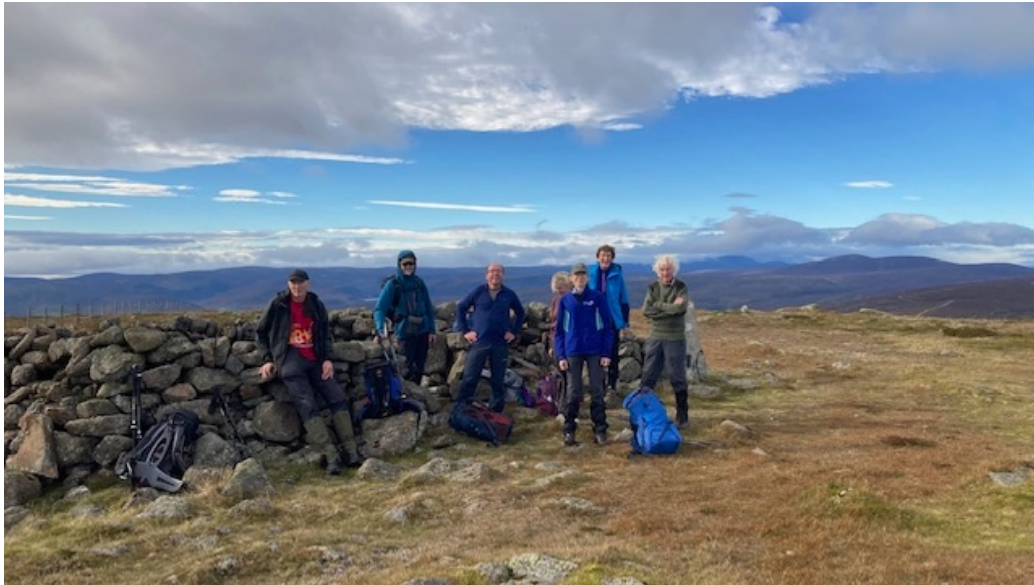
Another picture at the summit