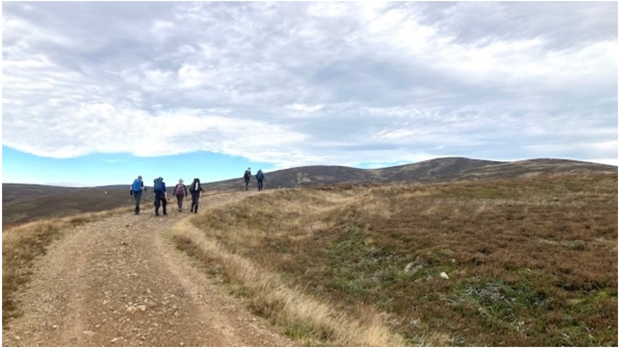
Near the start of the walk