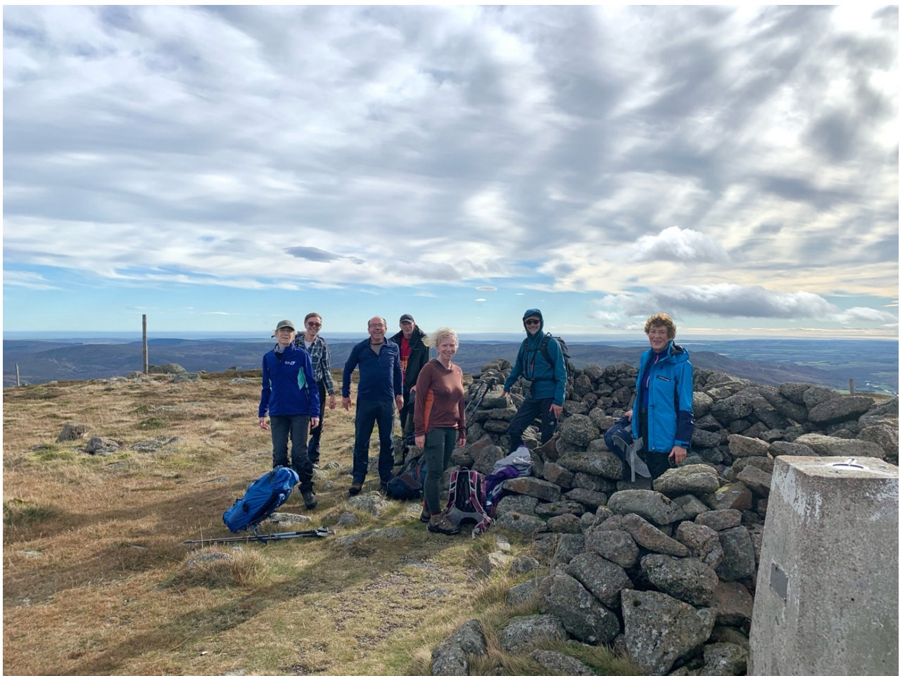
At the upper cairn and time for lunch