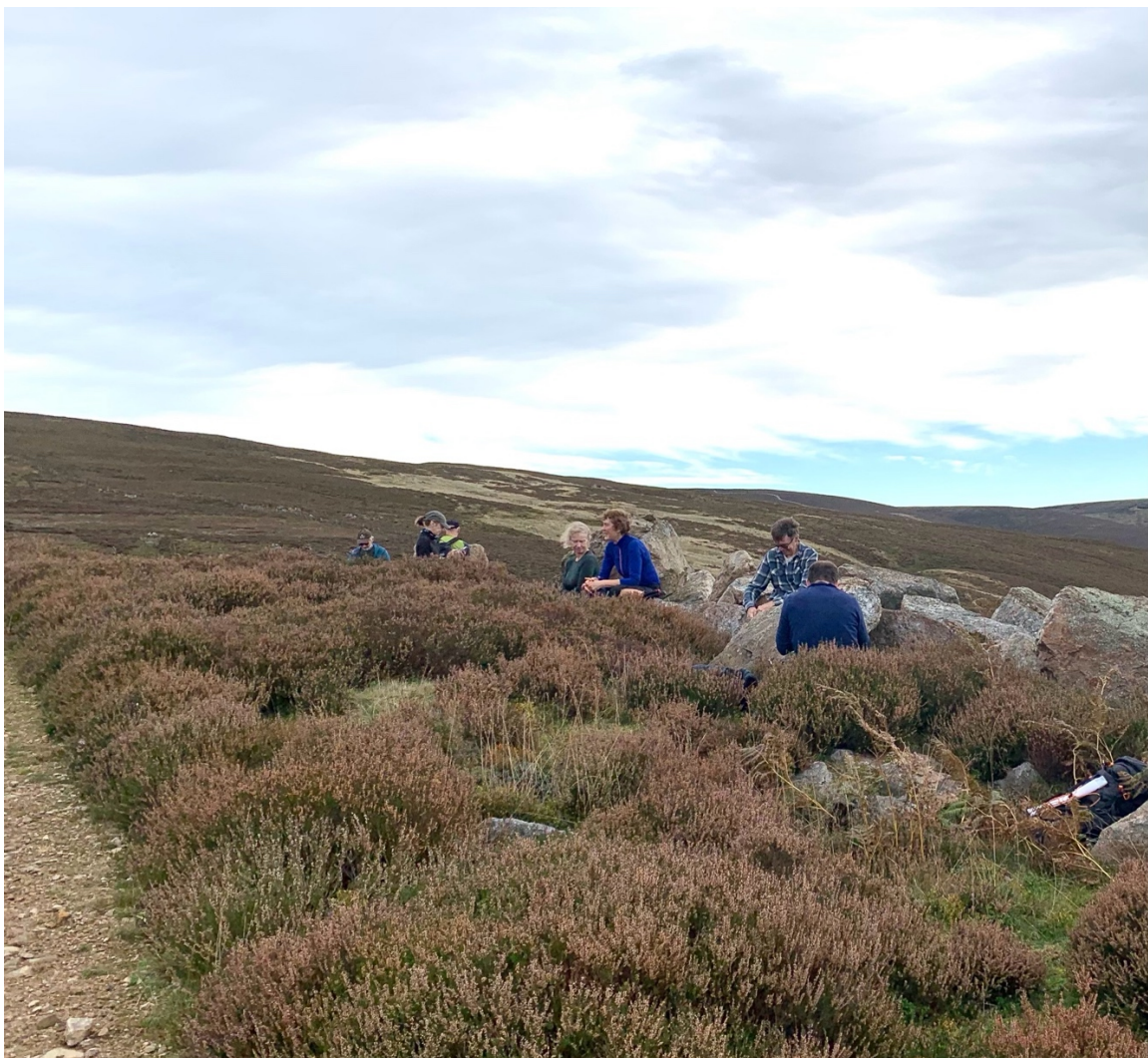
Time for a coffee break