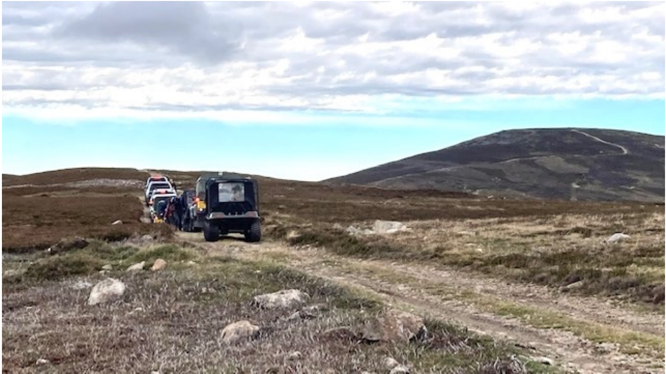
We pass a substantial shooting party on the way down. Grouse shooting is an important income generating activity on these hills.