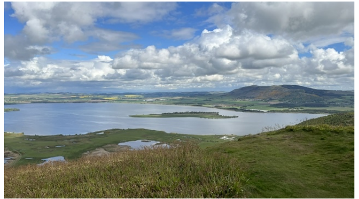
Wide open views along the top of the ridge before descending towards Ballingry