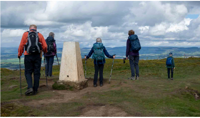
Trig point of Benarty Hill