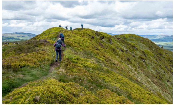
Heading towards location of Fort